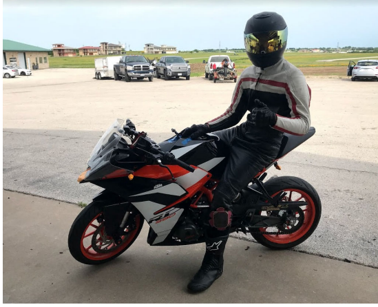
Figure 4 - Me at a track day

The advent of Vehicle-to-Vehicle technologies that allow vehicles to communicate with one another through short wave communications will further revolutionize safety in motorcycling by alerting drivers of the presence of other vehicles. However, even currently safety technologies in cars are already helping motorcyclists stay safer. Technologies such as blind spot monitoring, automatic emergency braking systems, and lane-keep assists are helping drivers avoid mowing over motorcyclists because they didn't see them. At the end of the day, motorbikes will always be dangerous; the best thing to do is to stay alert, ride defensively, and wear safety gear. A track day is also a great way to learn better bike control, even if you don't plan on finding the limits of what your bike can do!