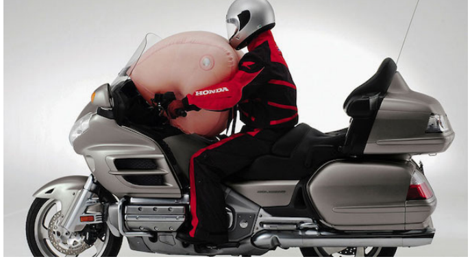
Figure 2 - Honda Goldwing equipped with an airbag

Safety gear alone has played such a substantial role in motorcycle safety over the years with improvements in helmet impact standards and innovations, airbag vests, better abrasion resistant materials, and more. Helmets now have technologies such as shatter resistant visors, integrated communication systems, impact absorbing technologies such as Bell's MIPS system (Multi-directional Impact Protection System), and lighter materials and more compact packaging. With gear such as Kevlar jeans, summer mesh jackets, abrasion resistant sneakers, and more, riding safe is easier than ever. A lot of the battle with safety on motorcycles is just getting people to wear safety gear. By making safety gear stylish, more comfortable, and easy to wear in public without being immediately obvious, more and more riders are able to find a safety solution that doesn't detract from their motorcycling experience. Moreover, some companies have innovated further by creating vests that inflate upon ejection from a motorbike in order to protect the rider from hard impacts. By wearing protective gear, you can prevent yourself from becoming the next meat crayon to take on I-35.