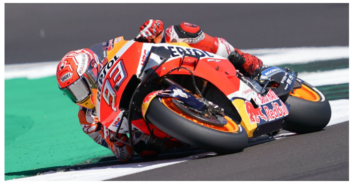
Figure 1 - Marc Marquez, a MotoGP racer and personal hero.

Often when I mention my motorcycle hobby, people explain to me at length about how dangerous motorcycles are, and that you would have to be an idiot to ride one. Previously I was completely oblivious to this fact, so I took it upon myself to reflect on the advances in safety technology in motorcycles. As it turns out, life on two wheels is significantly safer than it once was, and a motorcycle accident is not only more preventable, but more survivable than ever.